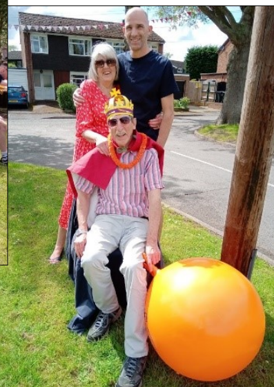
At the Coronation Street Party