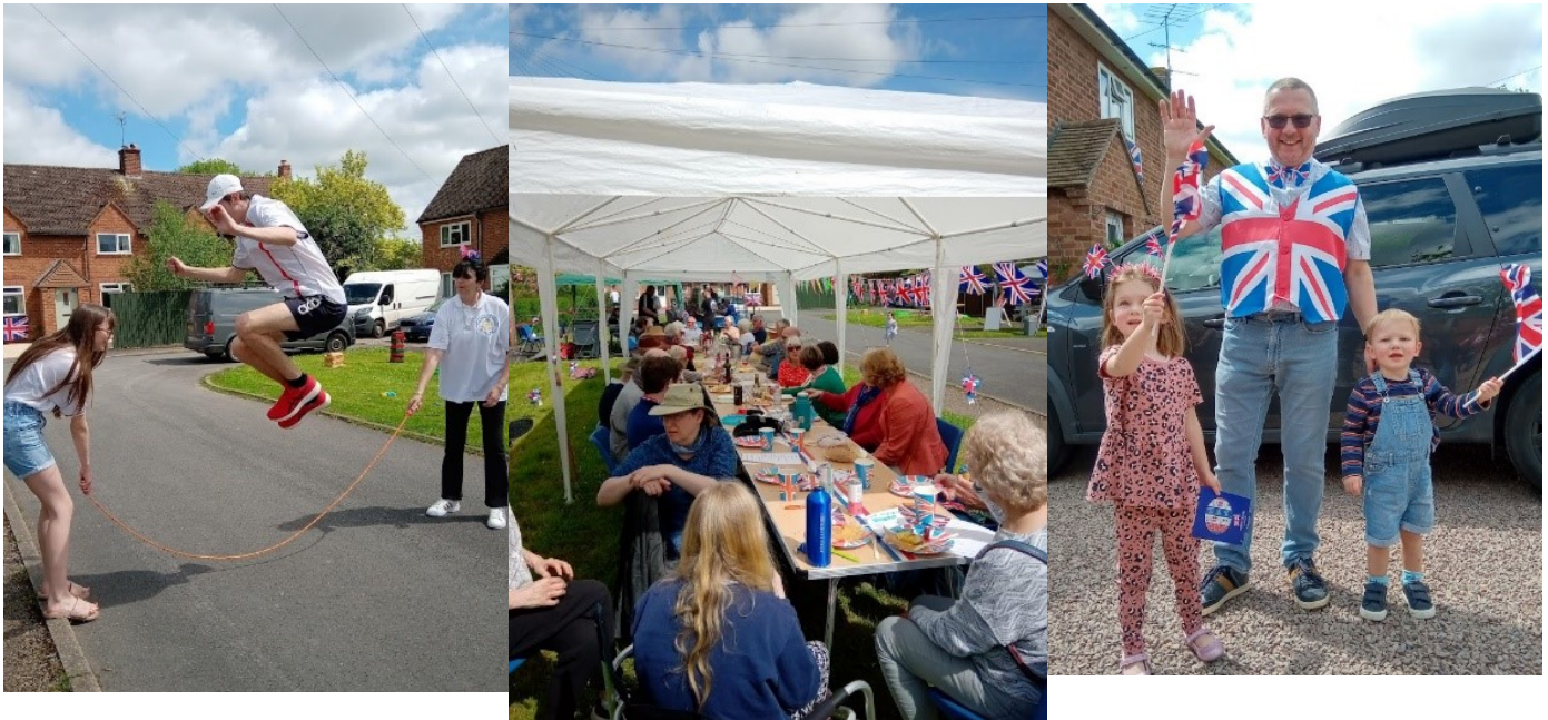
The Coronation Street Party was a great success

May saw the village hall open up for a Taster Day sponsored by 'Our Community Can' funded by the National Lottery to encourage everyone to get fit and active. We had a huge response to this day with people joining in with Dance, Tai Chi, arts and crafts as well as singing. Everyone felt in high spirits helped along by lots of tea and cake. Dance and Tai Chi were so popular that now both these sessions run every week in the village hall and continue to be extremely well attended.