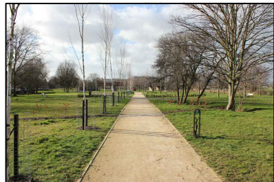
Existing Public Right of Way Re-Aligned To Suit Proposals With Rolling Gravel Finish