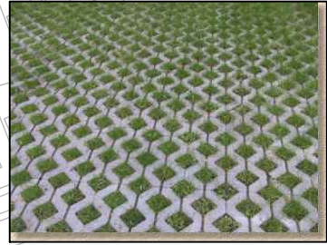
Shared Pedestrian/Cycle way (+ Emergency Access route) with Grasscrete finish